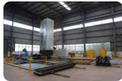
Large Floor Boring Machine