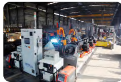
Automatic Welding Robot

Henan Dejun Industrial Co., Ltd has the independent import-export qualification, passed ISO9001 international quality system certification, and gains the international certificates of CE, SGS, and BV, etc, The crane machinery are popular with all customers and have exported to more than 120 countries, including the United Kingdom, Sweden, Russia, the United States, Canada, New Zealand, Zambia, Ethiopia, Egypt, UAE, Tajikistan, Thailand, Korea, the Philippines, Indonesia, Bangladesh, Mexico, Brazil, Peru, Pakistan, Morocco, Chile, Uruguay, Australia, Serbia, Maldives, Malaysia, Jordan, Honduras, etc.