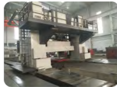
CNC Gantry Milling Machine