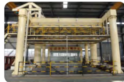
Electric hoist test-bed