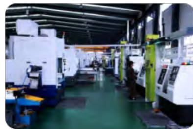
Intelligent Manufacturing Workshop